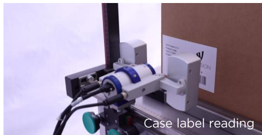
Case label reading

The system is specifically designed for pharma market