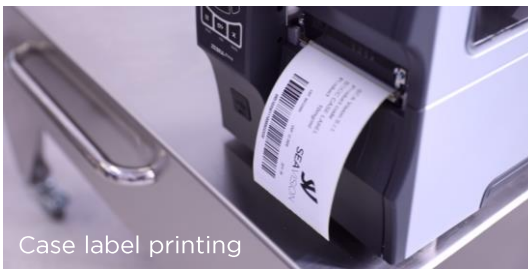
Case label printing